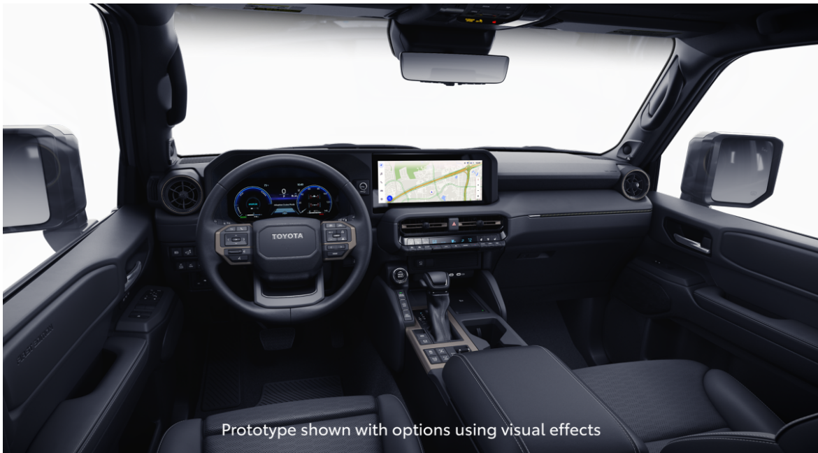
Prototype shown with options using visual effects

Transmission: 8-Speed Electronically Controlled automatic Transmission with intelligence (ECT-i) and sequential shift mode